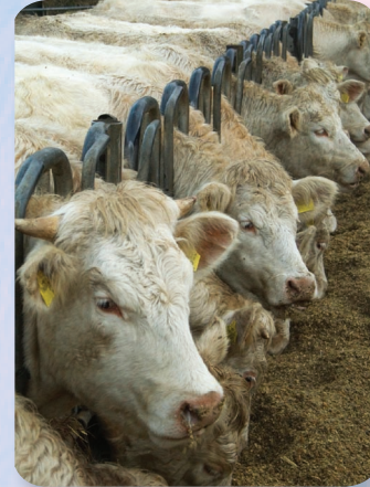
Eating grain-fed meat may create health issues.

Unsustainable meat production is linked to some of society's most pressing health problems such as antibiotic resistance, diet related disease, and harmful consequences from novel biotechnology and hormone use.